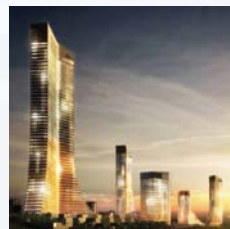
Varyap Istanbul – Turkey