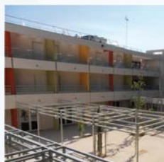
Mas de Lauze Accommodation for Dependent Elderly People Nîmes – France